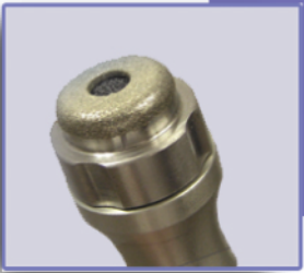
Patented Crystal-free Tip (Optional)