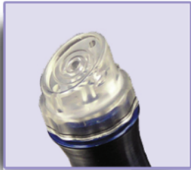
Patented Disposable HydroPeel™ Tip