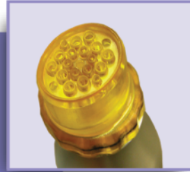
Spa Aggression Tip Patent Pending