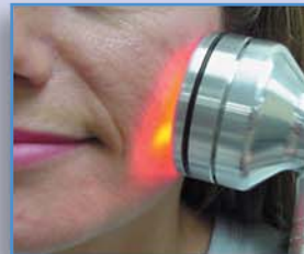
Blue & Red / Infrared LED Light